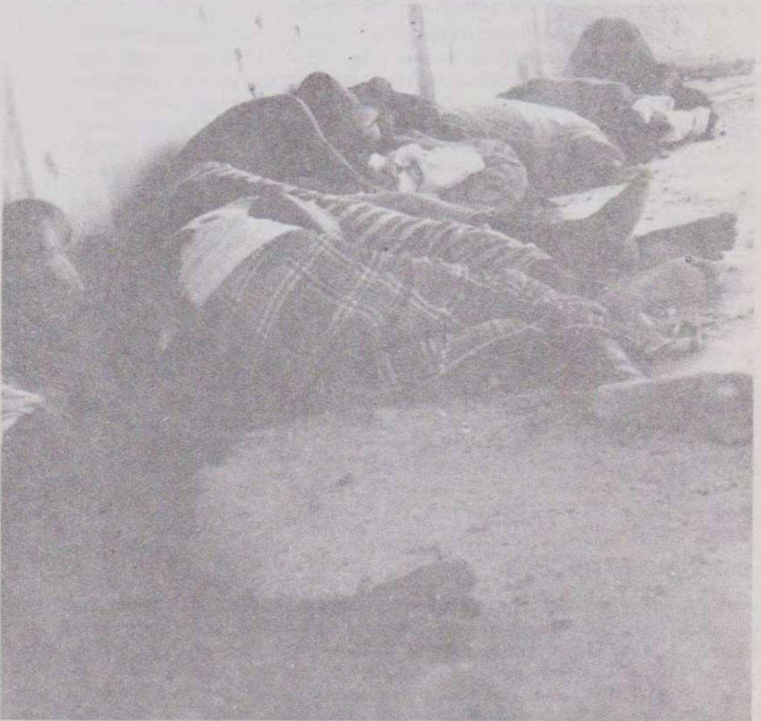
Victims of Sri Lankan State Terrorism