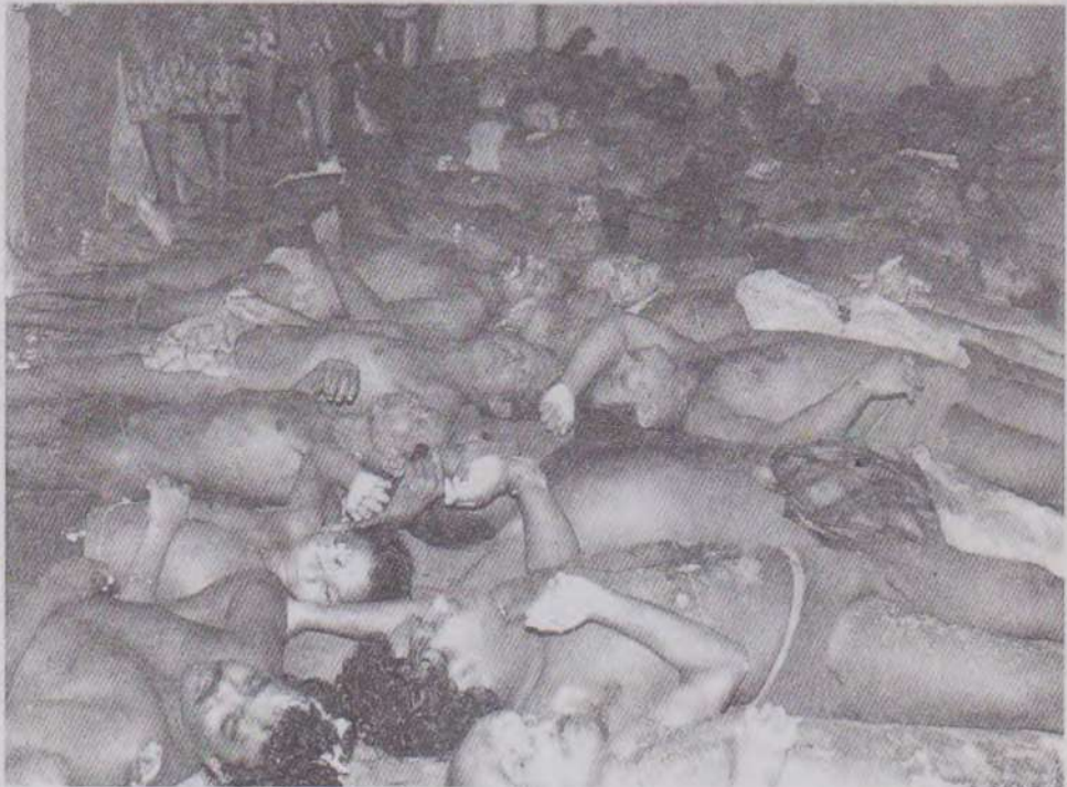
Massacre at Mandai theevu.