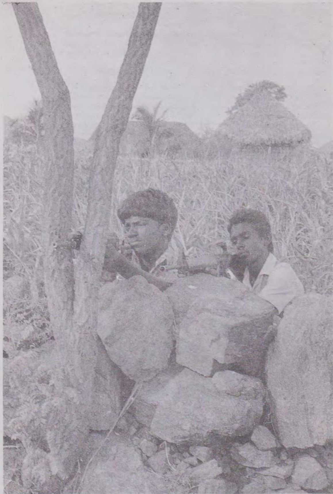
LTTE guerrillas at battlefield.